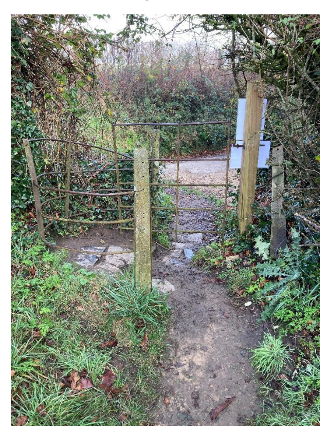
Appendix 3: Photographs of application route